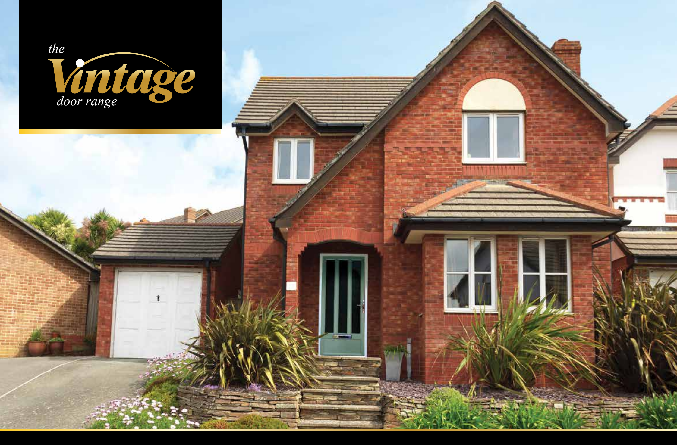
Stylish, colourful and secure doors.