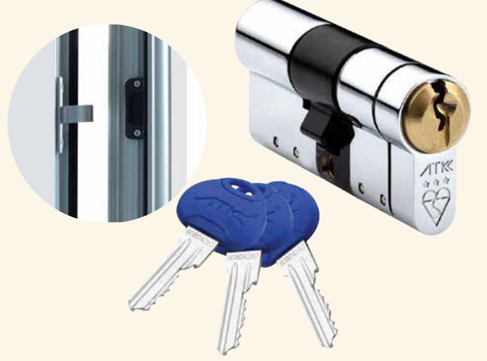
* upgrade to highest level of security, does not come as standard

For a start, all of our doors have been internally beaded, which means the glazing units cannot be removed from the outside. All panels have 9mm reinforcing which is twice the thickness and strength of standard panels.