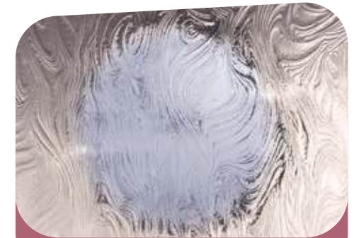
Privacy Level 3