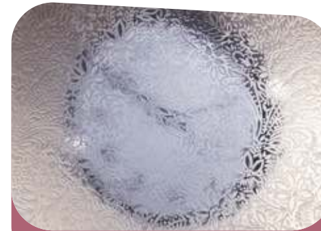
Privacy Level 2