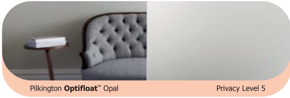
Pilkington Optifloat™ Opal