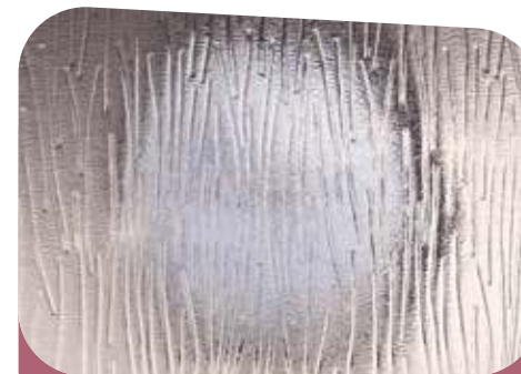
Privacy Level 4