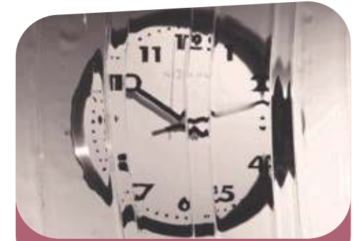
Privacy Level 1