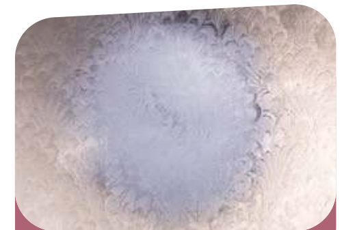
Privacy Level 5